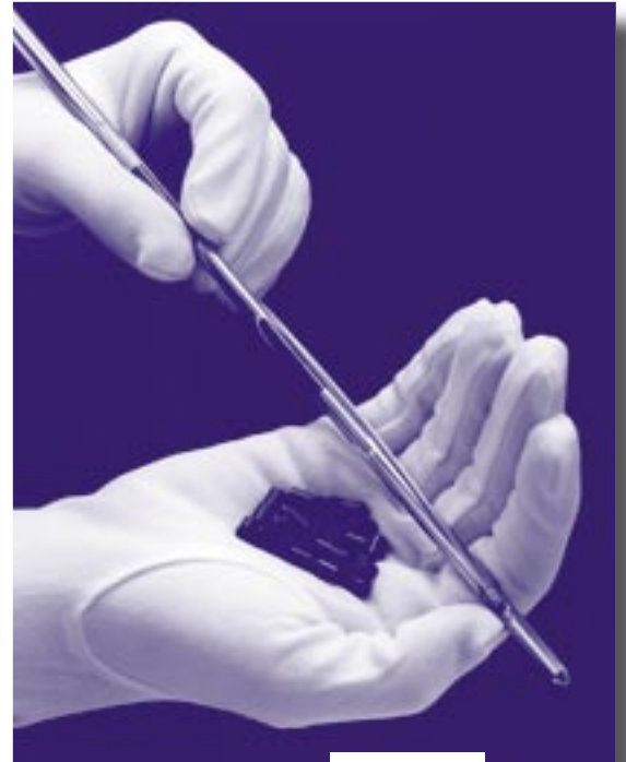
Spent nuclear fuel is most commonly in solid ceramic pellet form, about the size of a pencil eraser, secured inside an assembly of strong metal tubes.