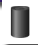
Actual size of fuel pellet.