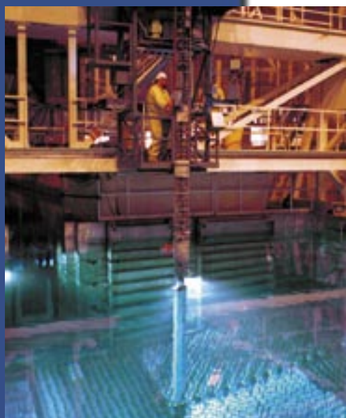
Spent nuclear fuel storage pool.

High-level radioactive waste resulting from defense programs is stored temporarily in underground tanks and vaults at government sites. High-level radioactive waste will be solidified in glass (some waste has already been solidified), packaged in stainless steel canisters, and placed in shielded casks for transport to the repository for disposal.