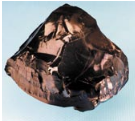
High-level radioactive waste is made solid by mixing it with glass-forming chemicals in stainless steel canisters and then subjecting it to heat. The result is a hard glass-like substance.